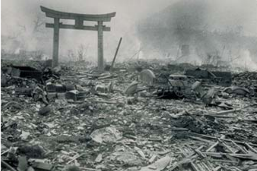
*Scene of bombed-out Nagasaki, August 9, 1945

The Nagasaki bomb was exploded at a height of 503 meters (1,540 ft.) above a densely populated valley just north of the city's center. Here, too, the explosive force and heat instantly impacted ground zero, swept out to the hills and back. Its destructive heat and force exceeded that of Hiroshima. The combined resident-plus-temporarily present population total for Nagasaki on the bombing date is estimated at 260,000–270,000.